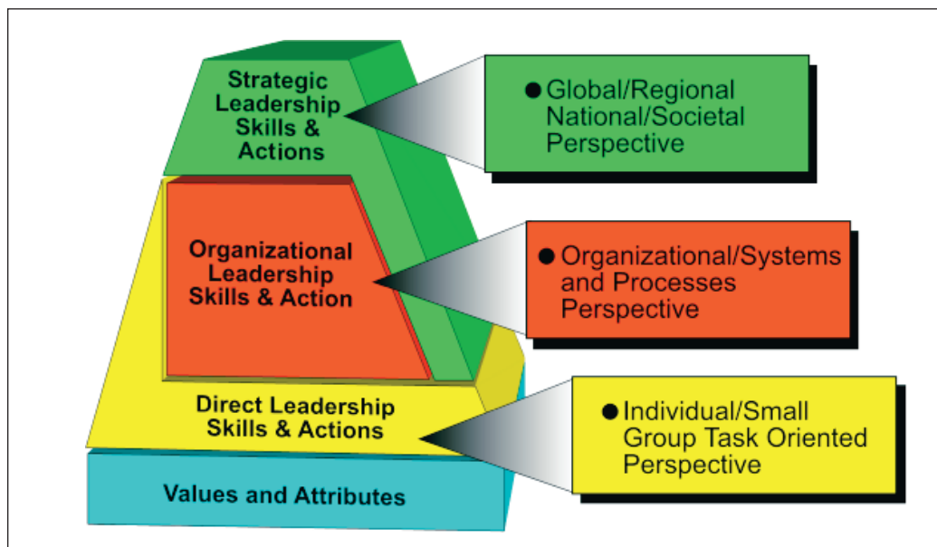
Figure 1.2 Army Leadership Levels